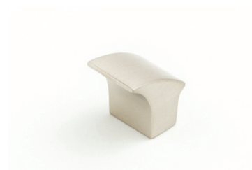
Dull Brushed Nickel